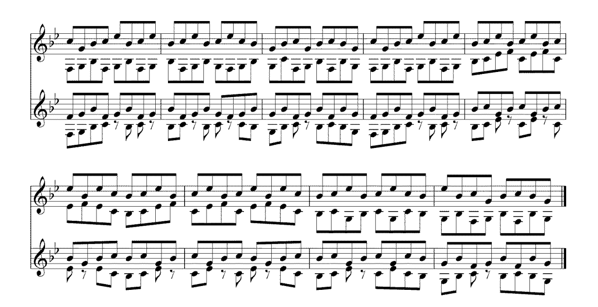
Example 2. Sudamala, First Variation Section

My teacher, I Wayan Locéng, also devised two variation sections based on this basic theme (which I discuss in Gray 2011, 176). These themes can be heard in the video, part 2, at 32:15 for the first variation and 34:04 for the second variation (see Examples 2 and 3). These variations keep the structure of the basic theme, but the first makes the texture denser through left-hand figuration, while the second develops a related melodic pattern in the left hands. This type of variation influenced my own development of themes in The Birth of Kala .