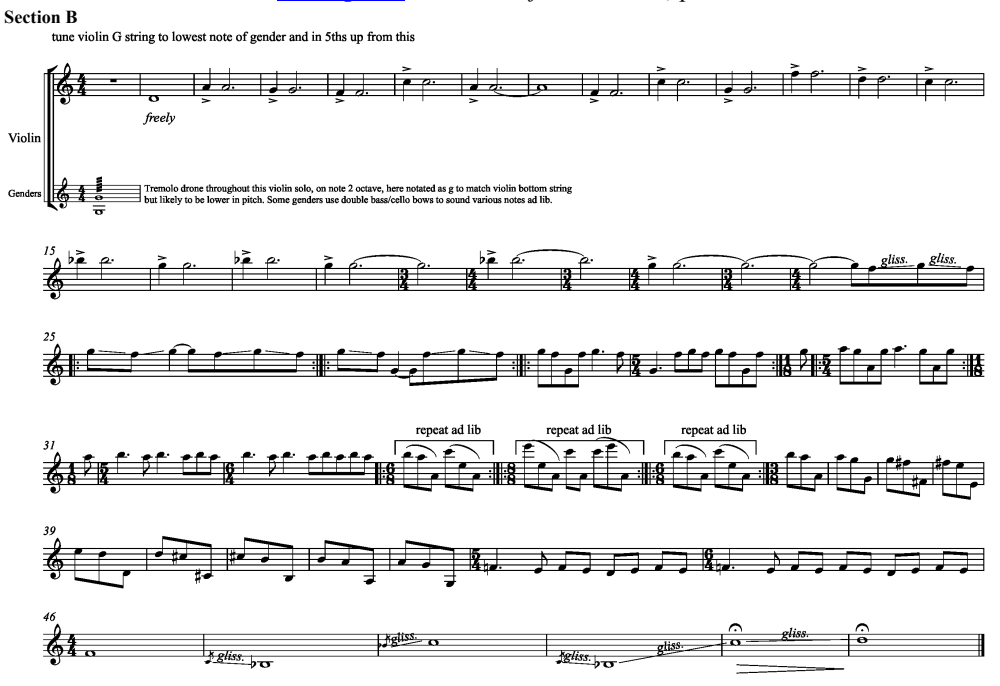
gendér note 2. This tuning process meant that the violin passage had to be transposed up (more or less) a semitone from my original notation to fit the stretched octaves of the gendér. In general, I adopted an intuitive and adaptive approach to tuning, as opposed to the mathematically calculated microtonal exactitude of some gamelan composers, which seems somewhat alien to Balinese and Javanese thinking about pitch (see Perlman 1994).