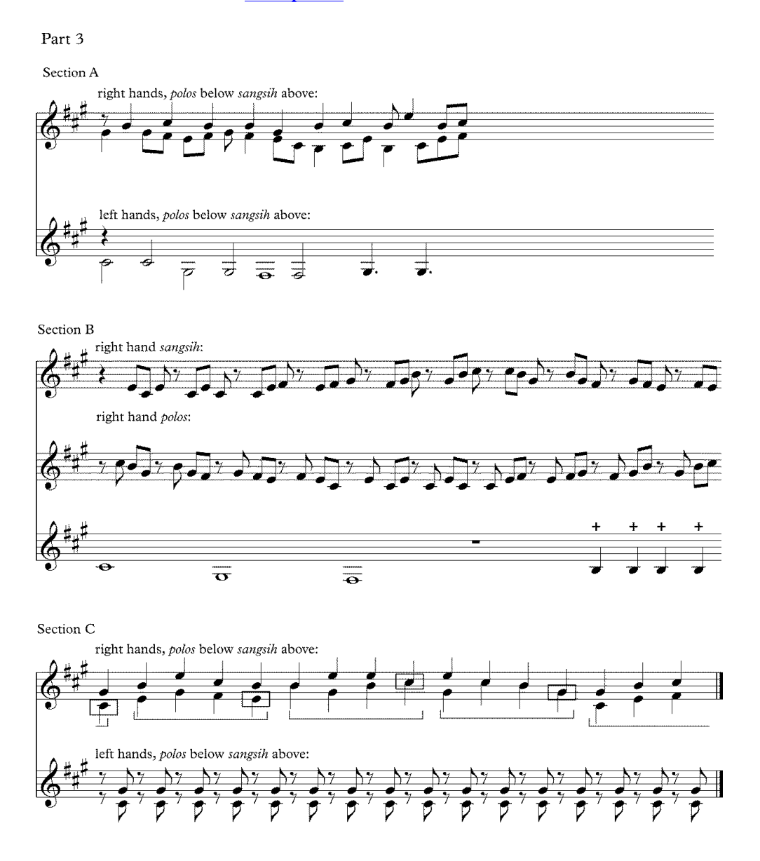
Example 13. Melodic Cells in Part 3

forms that are a defining feature of "traditional" gendér music (Gray 2006, 2011). <sup>10</sup> Example 13 shows how variation takes place through the expansion and then contraction of the melody. The relationship between the left-hand melodies of sections A and B is clear, as it involves a simple doubling of speed. The relationship between the left-hand melody and the polos melody of section C is less clear—boxed notes show the melodic