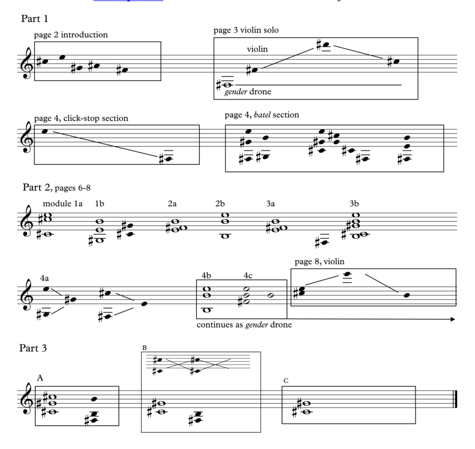
Example 15. Harmonic Outline of The Birth of Kala

defined. Indeed, all of the modules exhibit this tendency to a central pivot with two outlying pitches, high and low, usually B (note 5).