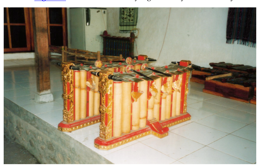
Figure 1. Balinese Gendér Wayang.